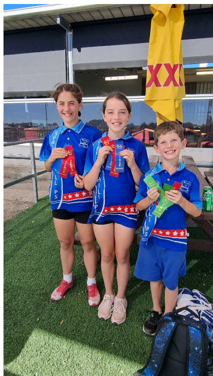
Reid family showing off their ribbons!