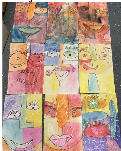
Creating Picasso Portraits