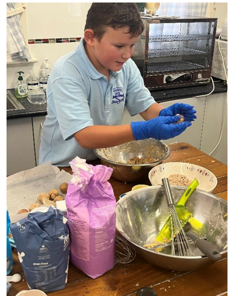
Cooking San Choy Bau & Snickerdoodles