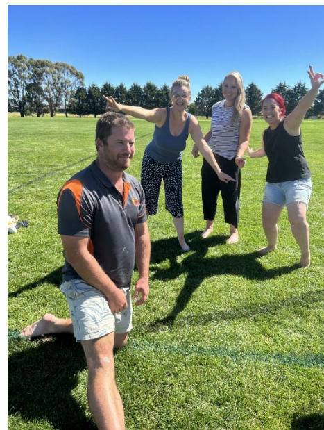
Parent Relay — Going for Gold!