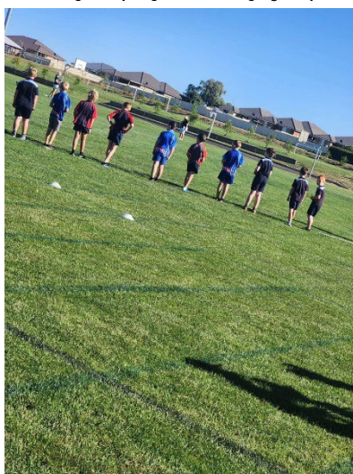
Ready to race!