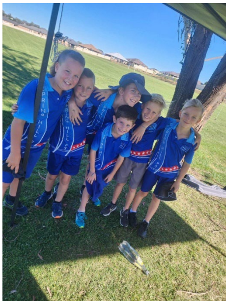
Boys looking after each other!