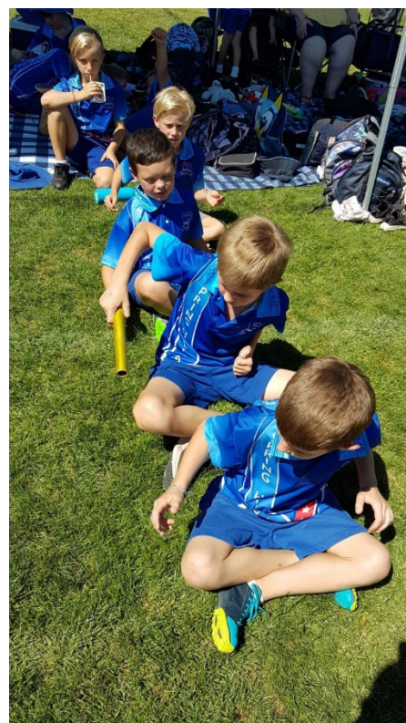
Jnr boys practising their changes.